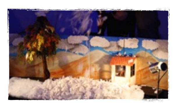
<u>Spring</u> - As spring arrives the snow begins to melt, along with the ice in Mr Bumblegrum's heart. Bobby the Mushroom, with the audience's help, blows away the dark clouds to reveal a blue sky. They call Mr Bumblegrum to show him the hope that comes with Spring. He is joyful again and begins to grow flowers and help nature to grow back once more. He discovers joy again.

<u>Winter</u> - The forest is all gone, but for one lone tree in front of his house. It becomes cold and begins to snow. Suddenly a snowstorm begins and Mr Bumblegrum becomes scared. He cries out for help and the tree comes to life, showing him that he is alone, and then the tree also says goodbye. Now lonely, sad and regretful he apologises and wishes for friendship again. He goes home.