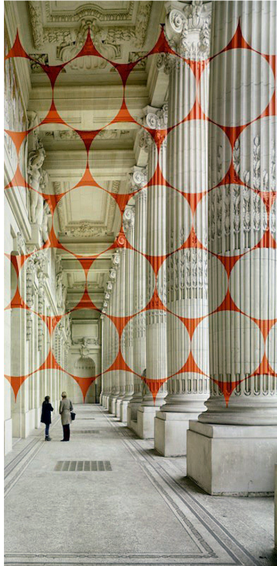
Twenty-three discs, twelve hollowed halves and four quarters, Grand Palais, Paris, France, 2013