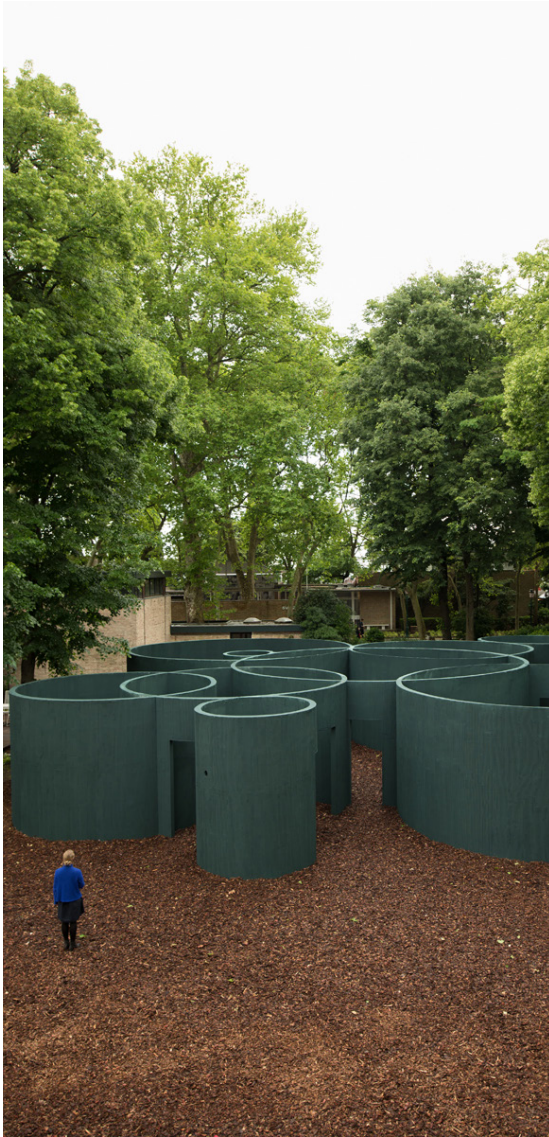
Vara pavilion: XV International Architecture Exhibition, Biennale di Venezia, Venice, Italy, 2016