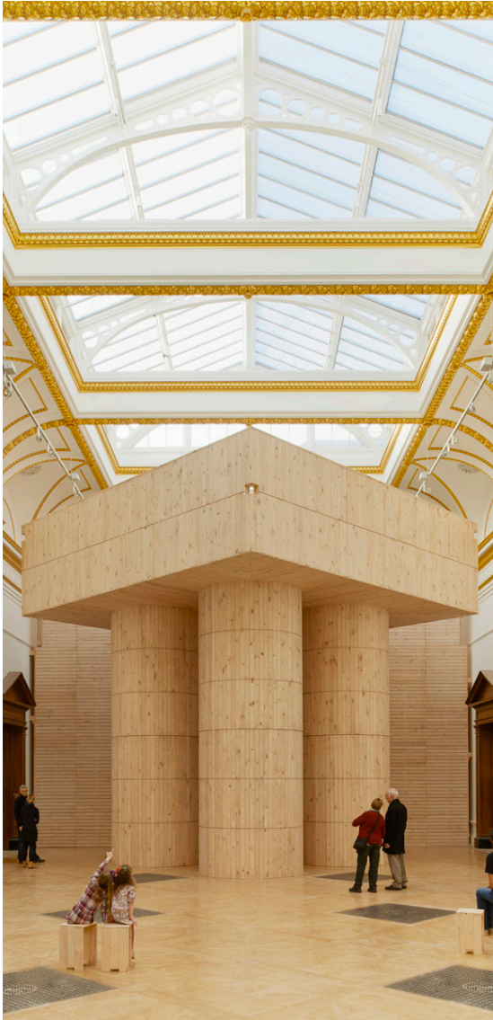
Blue pavilion: Sensing Spaces Exhibition, Royal Academy of Arts, London, UK, 2014