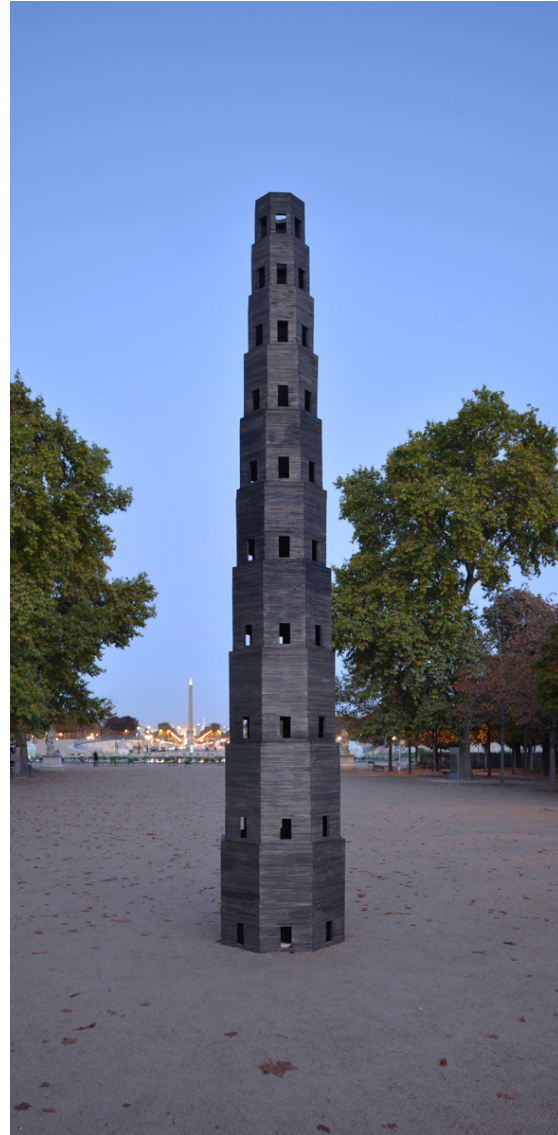
Deci pavilion: Solo Gellerie, Contemporary Art Fair, Paris, France, 2016