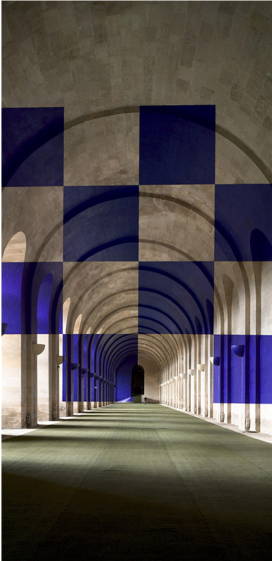
Huit Carres, Orangerie du Chateau du Versailles, Versailles, France, 2006