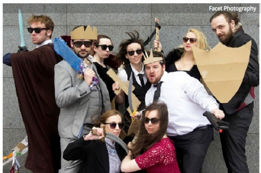
Dungeon Masters - Pub Corners Poets