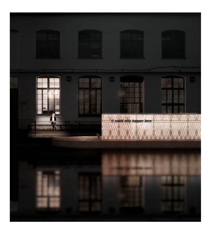
Floating Cinema 2013 design by Duggan Morris Architects

Acer P5390W (3D Ready) – External Projector Cyclone Micro AV unit Input Selector