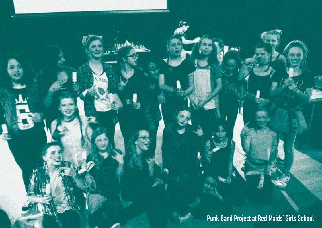
Punk Band Project at Red Maids' Girls School