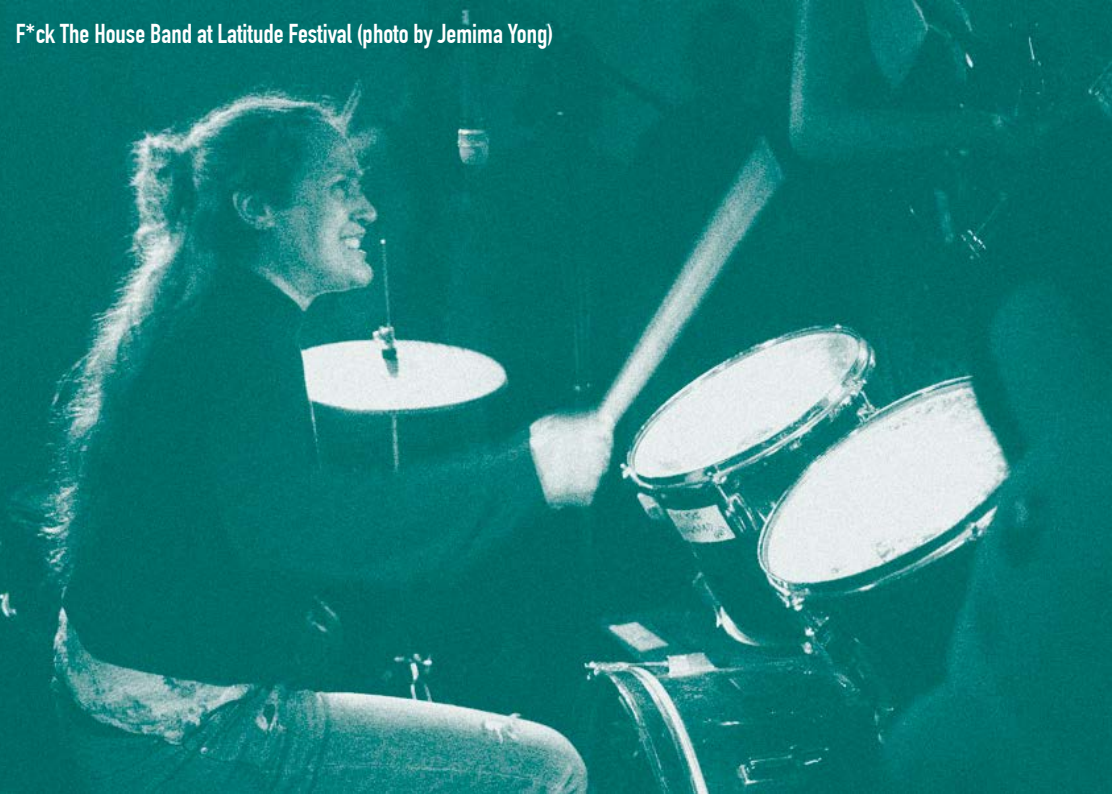
F*ck The House Band at Latitude Festival

There will be time for stumbling, falling over and shyness, but there will be more time for shouting and hitting things.