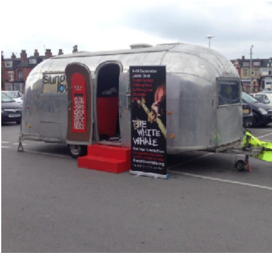
2.0 REFERENCE IMAGE ( Airstream Caravan )